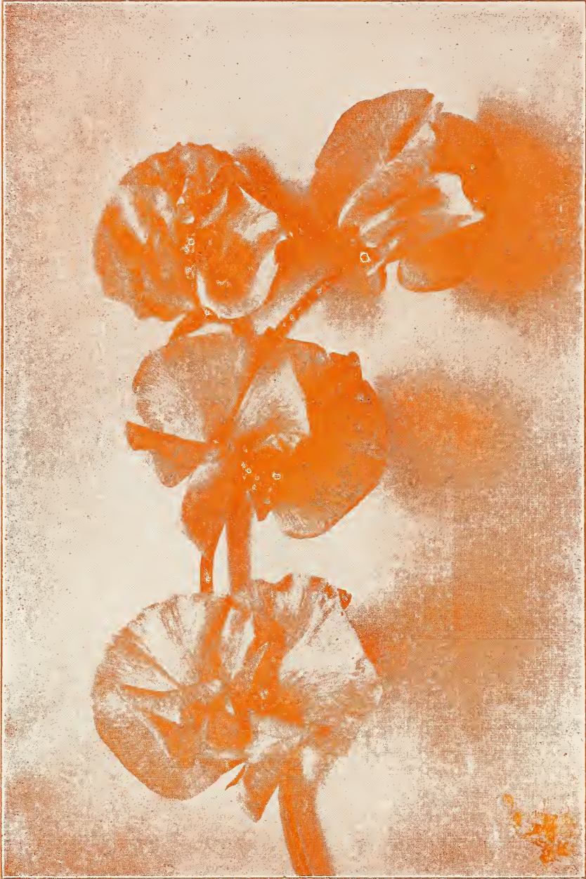
AMERICAN BEAUTY Old Rose Suffused Salmon